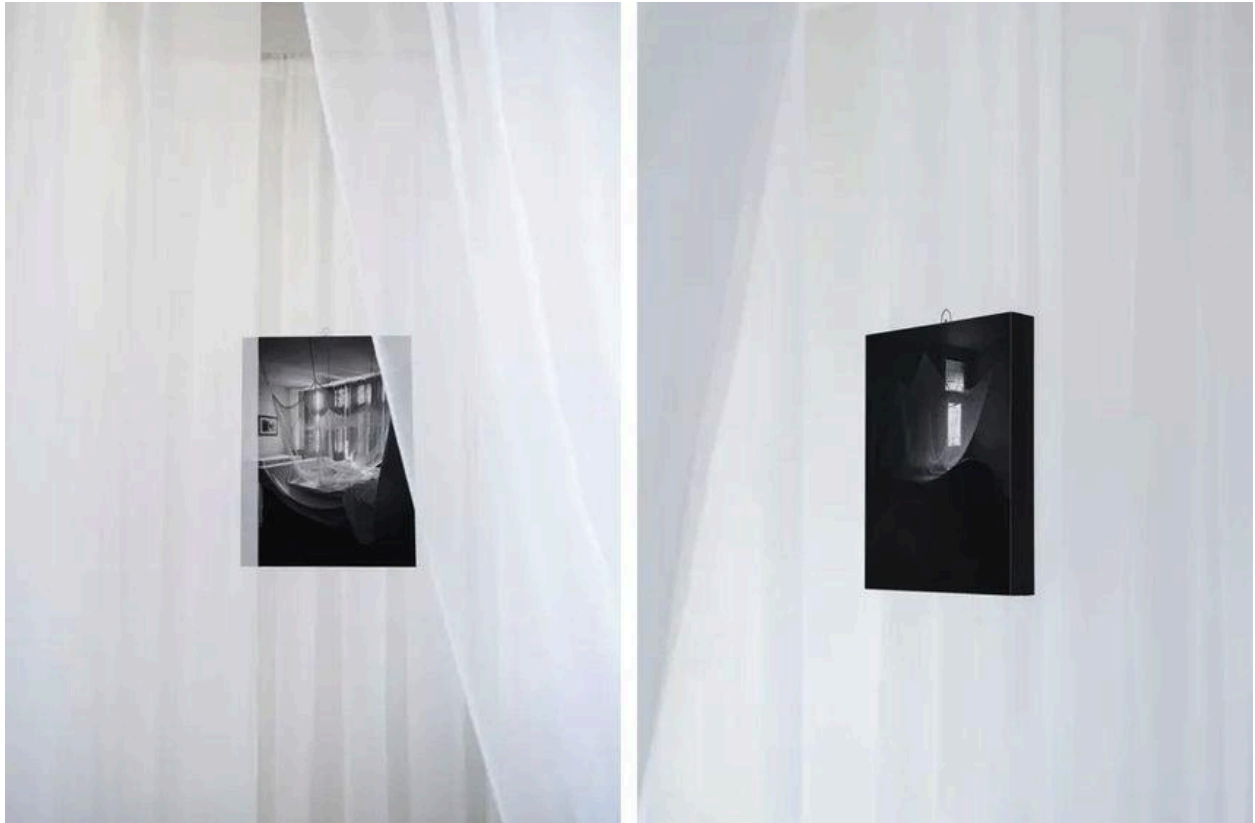
Left: Sun Young Kang - Within the Void: Reaching for Memories I, 2024 / Right: Sun Young Kang - Within the Void: Reaching for Memories II, 2024