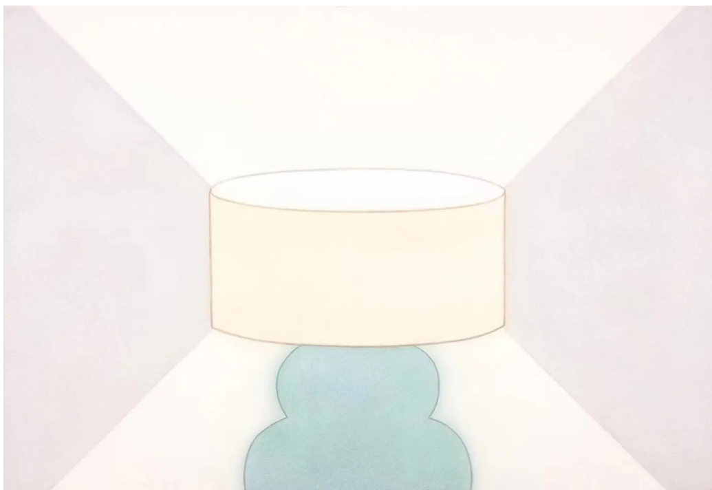
Green Lamp, Watercolor on Paper, Mounted on Wood Panel, 19.5×27.5in (50 x 70 cm), 2022, Courtesy of YI GALLERY

This year, I started making personified slices of bread out of ceramic, and different forms of blue cheese made of mixed materials. I find it quite interesting to transform ordinary things into different forms with a touch of imagination and place them in different spaces with other materials. A banal object suddenly takes on a sense of humor. This is a very interesting process.