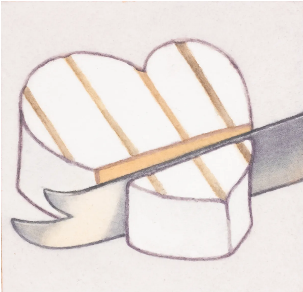
Neufchâtel, 3.7×3.8in (9.5×9.8cm), Watercolor on Paper, 2022