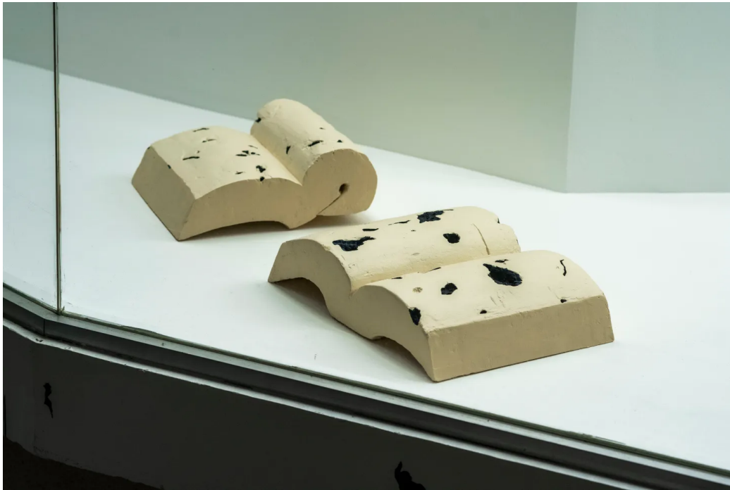
Installation view: Trooop Fort, Rola-bola, Rouen France, 2022.