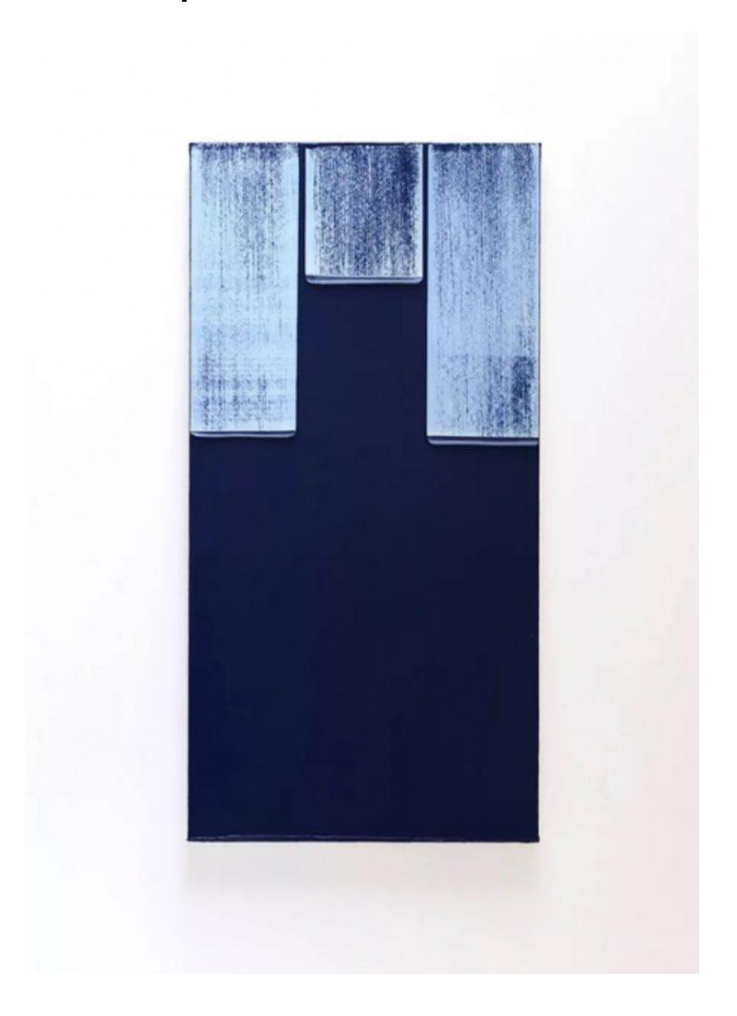
GJ Kimsunken, Figuration 21. 31 (son) (2021).