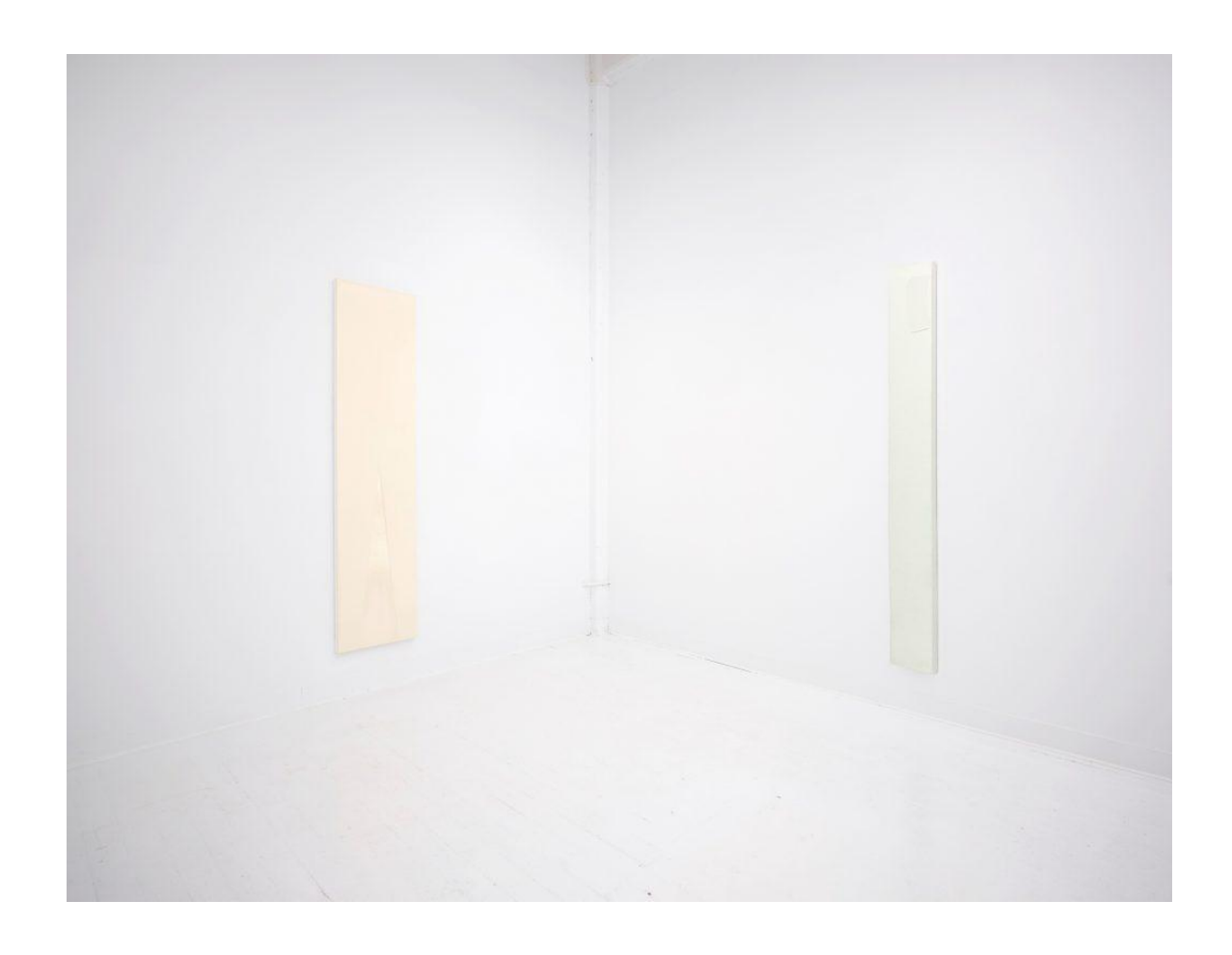
Installation view, "GJ Kimsunken: Figurations," 2022.

About the Artist: Seoul-born, New Jersey-based artist GJ Kimsunken (b. 1985) creates luminous, minimalistic canvases that obliquely reference the human figure, hovering hauntingly between representation and abstraction. His new exhibition "Figuration," at Brooklyn's Yi Gallery, brings together a group of recent monochromatic works made through the artist's methodical process. Kimsunken primes his canvases with gesso, which he then covers with multiple layers of oil paint, imbuing the works with luminosity and a rich, substantial physicality. From here, the artist scrapes away areas of paint from the canvas to create both passages of emptiness and depth.