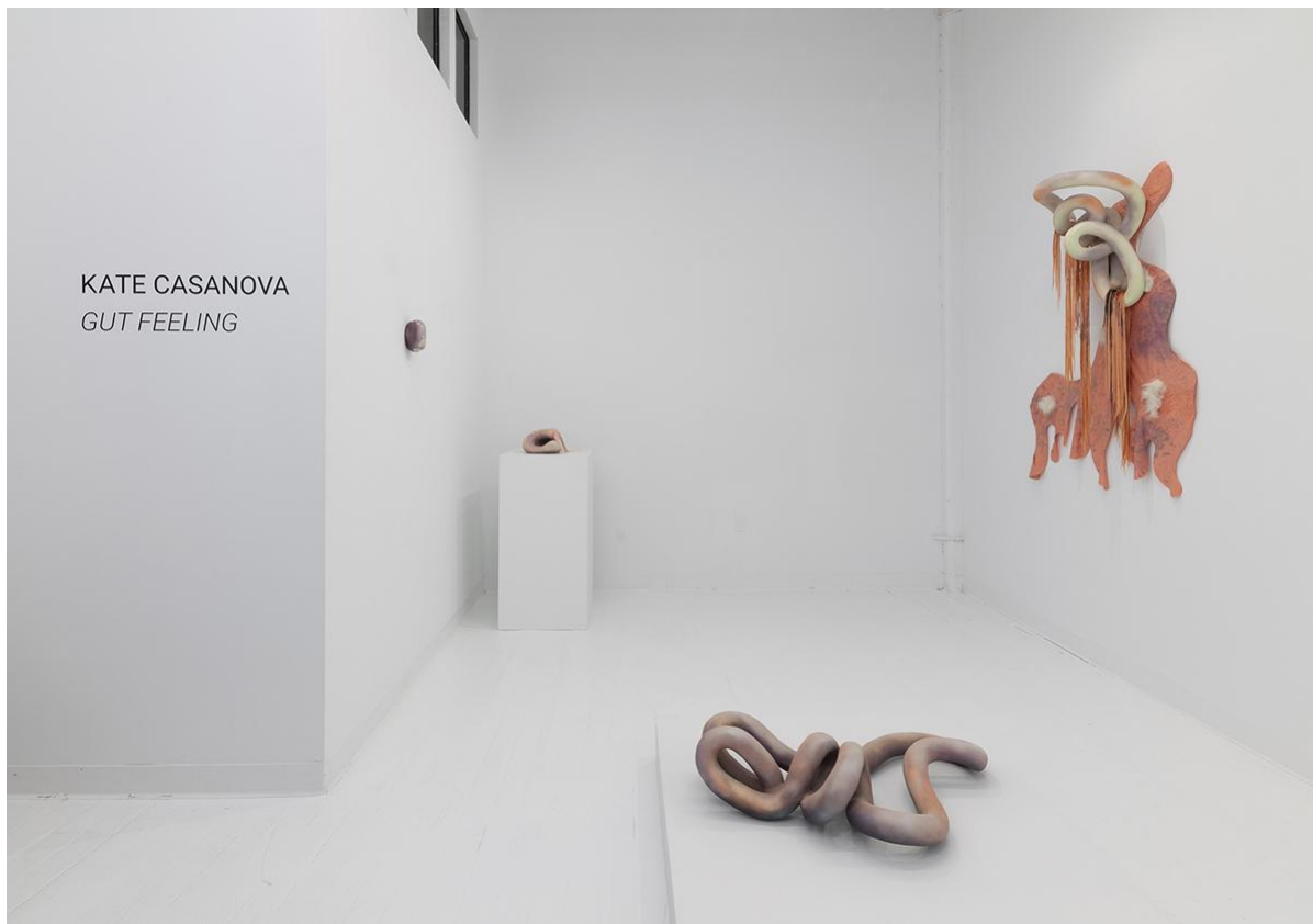
Installation view of Gut Feeling at Yi Gallery, photo courtesy of Yi Gallery

Some of the biomorphic forms in this exhibition, like an unruly intestine or spleen, bulge and coil in defiance of gravity. I wanted these objects to convey a sense of bodily autonomy as if they operate independently from a governing brain. These objects resist the mind-over-body hierarchy and embrace the body as a system of shared governance.