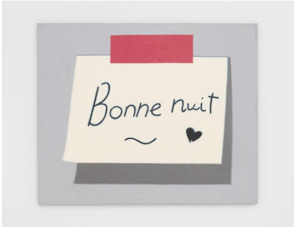
Li Xia, Bonne Nuit (Good Night) (2020).